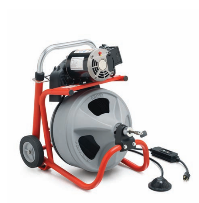
Model K-400 Machine Only