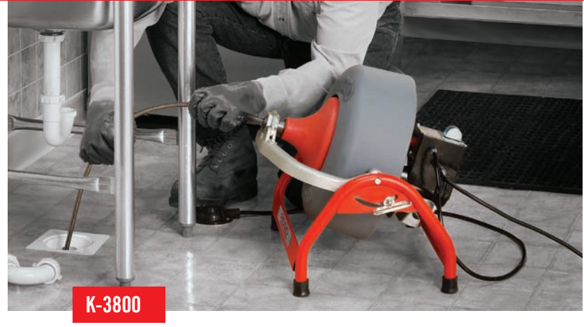
A powerful \frac{1}{12} HP machine that is easy to transport with a quick release drum and built-in handgrips.