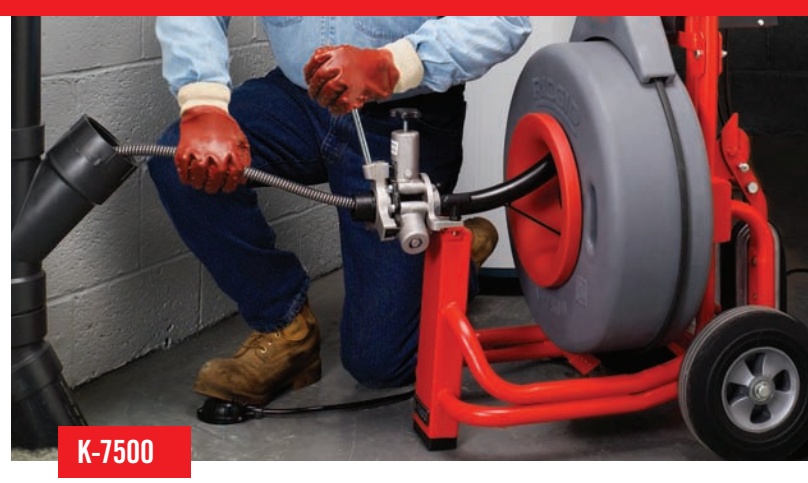
The choice of many professionals because of its performance and durability, the K-7500 is ideal for all the toughest jobs including roots.