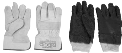
Figure 7 – RIDGID Drain Cleaning Gloves – Leather, PVC