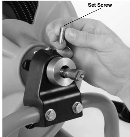
Figure 3 – Remove and discard the Cable Lock Set Screw

Remove and discard the 5/16" x 1" cable lock set screw from the Set Collar Assembly. The cable lock set screw is provided during packaging to keep the cable from coming out of the drum during transport ( Figure 3 ).