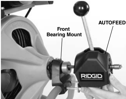
Figure 5 – Mounting AUTOFEED onto the Frame