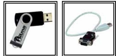
Software Ritmo Transfer