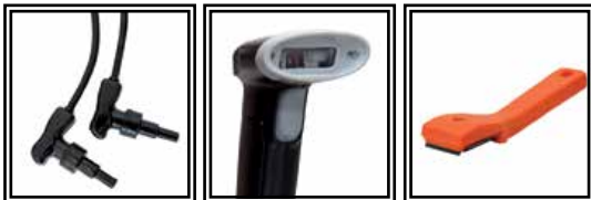
Universal connectors 90°