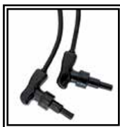
Universal connectors 90°