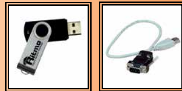
Software Ritmo Transfer